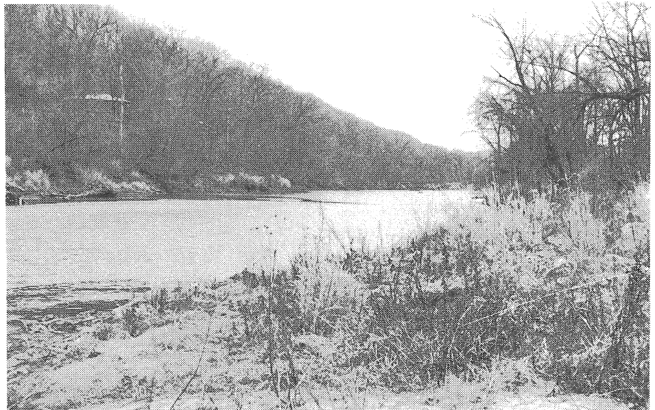
FROM THIS spot and for 1,000 feet downstream, the remnants of Blackhawk's tribe who had escaped the massacre at the Battle of the Bad Axe, crossed the Maquoketa river when it was at flood. It is here that legend has Abraham Lincoln with other troops forcing the Indians across. Picture taken at old Dales Mill crossing.

Renew your subscription to Jones County Historical Review now!