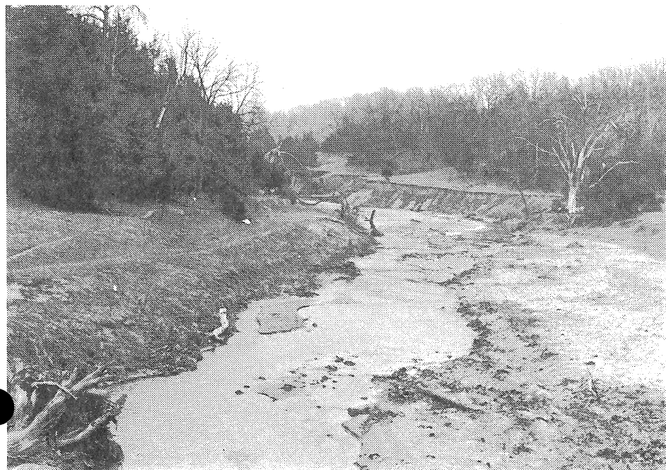
LOWER REACHES of the Jordan creek valley. Blackhawk's tribe found sanctuary here for a few days, before being overtaken by troops. Burial ground spoken of in story is located in this area.

THIS WAS THE ACT THAT BROUGHT DESPERATION UPON BLACKHAWK AND HIS PEOPLE. While all records indicate Blackhawk and his people to have