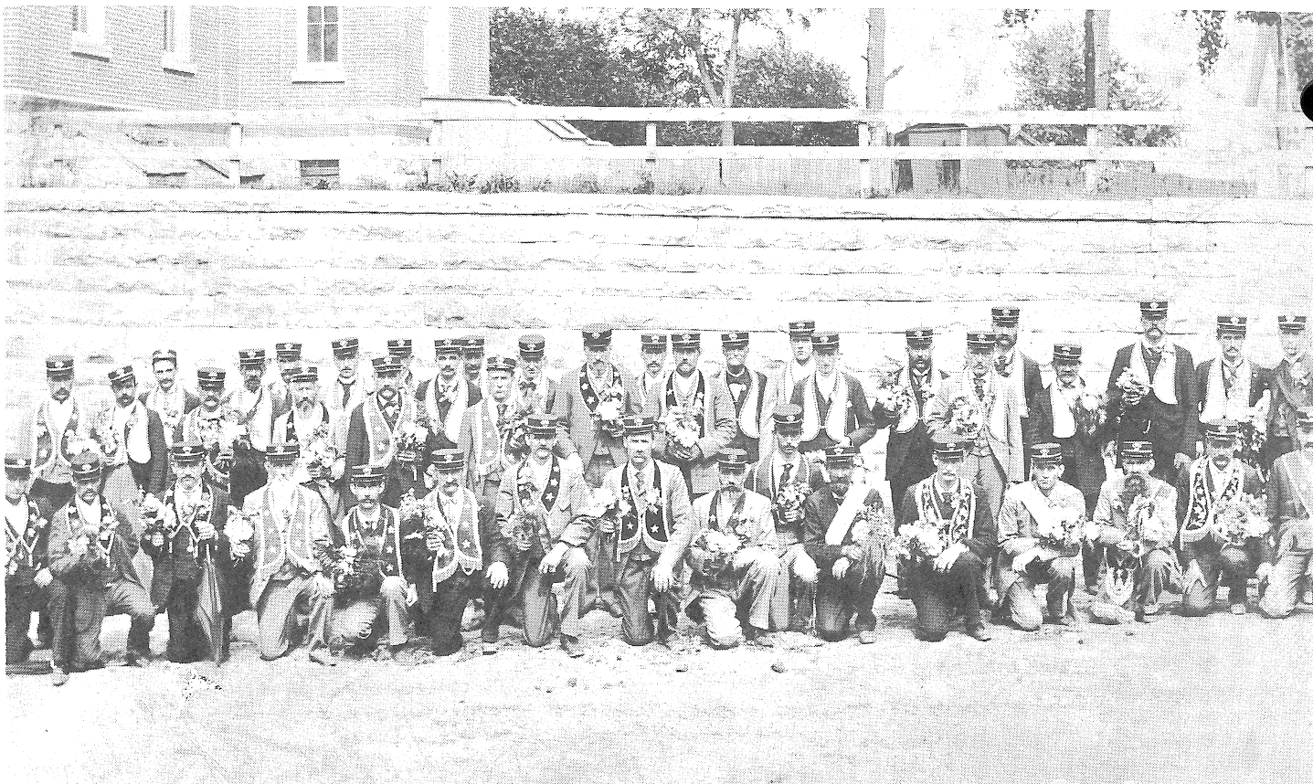
THE ODD FELLOWS LODGE was once an active group in Monticello. This photo was taken June 10, 1894 by H. W. Hagen, Monticello, who listed himself as "German photographer". The lodge members are lined up in front of a wall near the old opera house, now the location of the Monticello Community building.