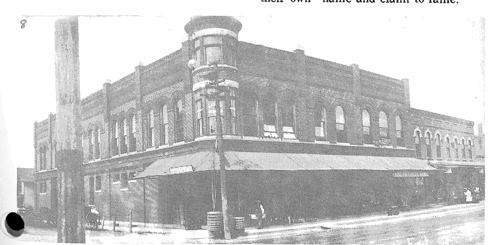
THIS EARLY DAY photo of the McNeill-Freese building in downtown Monticello was taken back in the days when the streets had a dirt surface. Note the hitching rails on the west side of the building. Eastwood Blvd. is now called Sycamore St. The building, housing McNeill's Hardware, Newhard's Clothing and Stuhler's Shoes, is located across from the Monticello Community building.