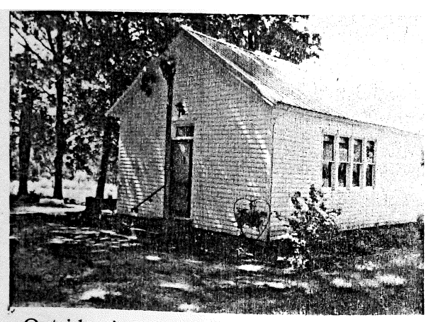
Outside view of Hardscrabble School

1865, recalling that there were more Indian kids than white children when she attended Hardscrabble School. The school was originally situated on the Tschantz farm, but around the turn of the century was moved to its present site on the Roller farm. Many students rode to school on horseback. When the children entered the primary grade, now called kindergarten, it was not unusual that they could not speak English because Swiss or German was the language which was spoken at home.