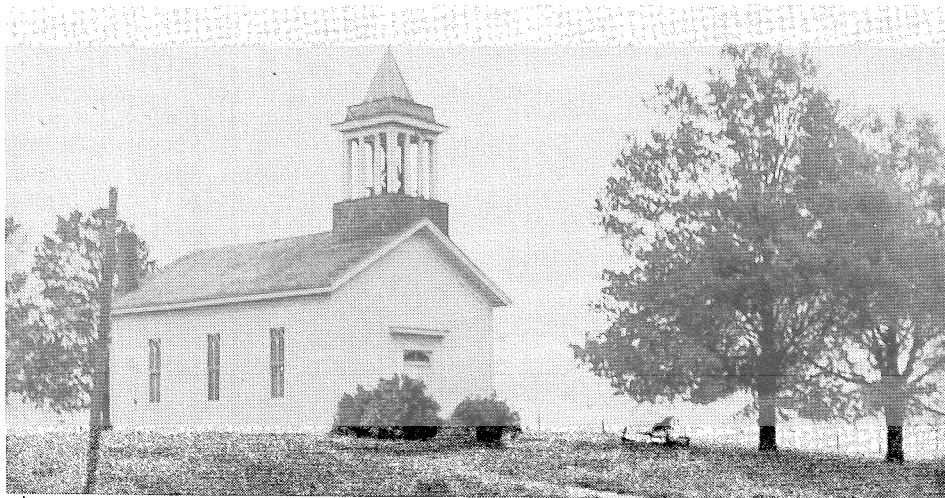
THIS PHOTO of Cass Center church was taken in 1965. The grounds and structure were maintained even though no regular services were held after 1950. The last funeral was that of George Watt held in October 1951. The church was organized in 1856 and was finished and dedicated in 1860. It was restored as a bicentennial project in 1976 and now belongs to the Jones County Historical Society.